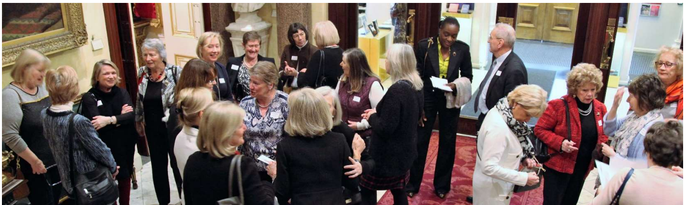
Visit to the Wallace Collection 9 th February 2017

The lunch and the guided tours were a great success and many of the Firebirds may well return to explore the collection in their own time.